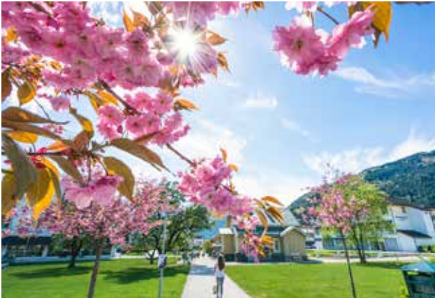
Sogndal city park