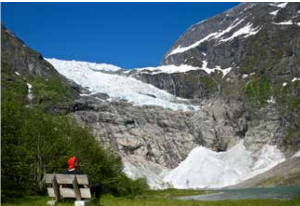
Bøyabreen Glaceier in Fjærland

You can see Bøyabreen Glacier at quite close range from the main road in Fjærland, or admire it from the Brevasshytta restaurant a five-minute drive inland, even closer to the ice. You can be lucky to see big blocks of ice crashing down.