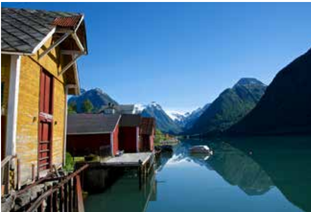
Fjærland and Fjærlandsfjord