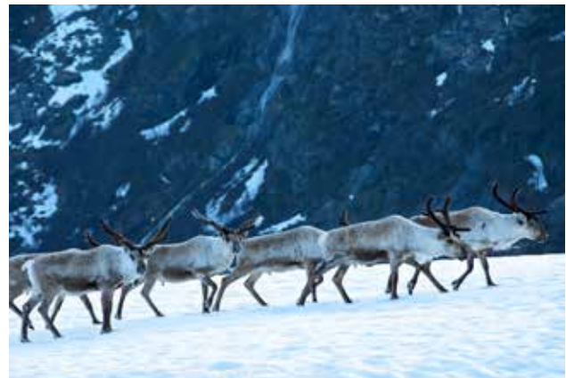
Reindeers in the mountains

Crossing Mt. Utvik you might be lucky and see grazing reindeer. Popular outdoor recreation area with ski centre and hiking trails. Soon the Nordfjord is appearing.