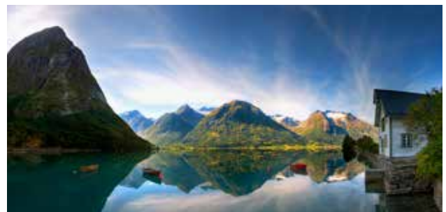
Lake Opstrynsvatnet

The road brings you past Hjelledalen Valley, across the mountain and to the spectacular viewpoint Flydalsjuvet, where you can absorb the magnificent view of the Geirangerfjord, before heading down the scenic road from Dalsnibba to Geiranger.