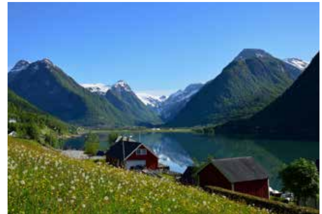
Fjærland and the glacier in the mountains

The narrow Fjærlandsfjord with its steep and forested mountainsides leads you to the edges of the majestic Jostedal Glacier. Along the fjord there are many hamlets and farms. Most of these farms are deserted, and they now serve as reminders of people's toil and challenges in former times. The water in the fjord is frequently coloured light green because of the glacial melt water.