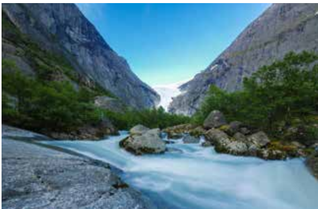
Briksdal Glacier in Olden

Olden is the gateway to the Briksdal Glacier, the most famous of the glacier tongues in Jostedalsbreen National Park, with 300.000 visitors every year. Briksdal is located at the end of the beautiful Oldedalen Valley. Olden is also an important cruise port.