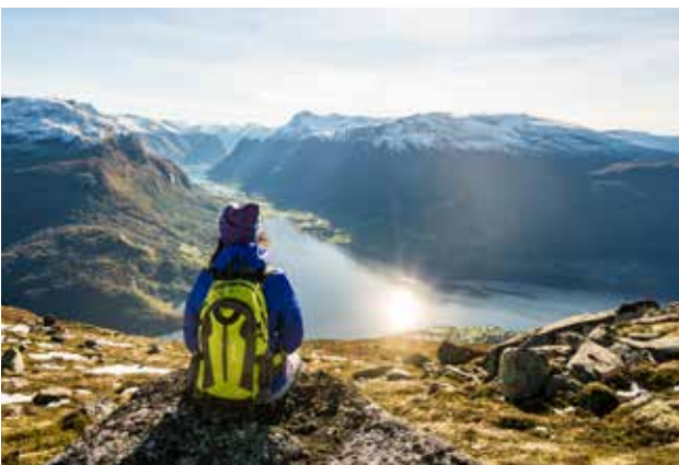
Hiking at Mount Hoven in Loen