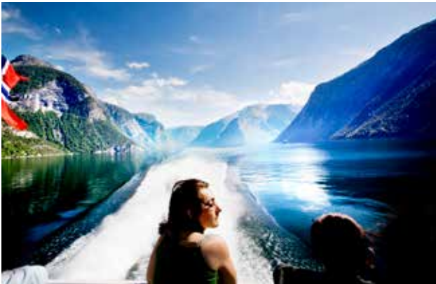
The Sognefjord - the King of the Norwegian fjords