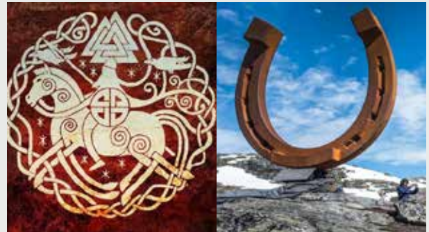
Drawing of Odin on Sleipner, and Sleipner's horse shoe at Mount Hoven