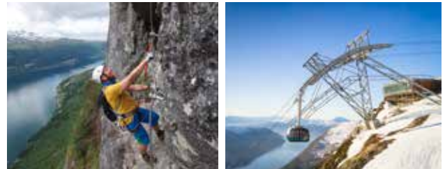
Via Ferrata Loen & Loen Skyliift

Loen village has been a magnet for tourists for more than a century, when ships from Europe began calling at Loen, and local farmers were involved in transporting tourists in horse-drawn transport from the fjord to the beautiful Lodalen Valley southeast of the village. Now visitors can take the Loen Skyliift from the fjord to Mt. Hoven (1011 m.a.s.l.), and see the fjord landscape, the mountains and the Jostedalsbreen National Park from above.