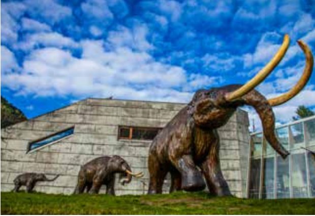
Norwegian Glacier Museum

This interactive museum gives you knowledge about glaciers and climate in new and innovative ways. The interplay within the natural environment and between mankind and nature, is highlighted through film, interactive models and individual experiments with real glacier ice.