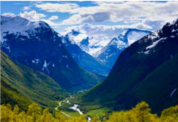
Scenic drive in Hjelledalen Valley