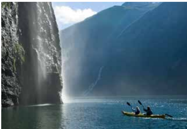
Kayaking in Geirangerfjord

Geiranger can also be a good connection further to/from Ålesund.