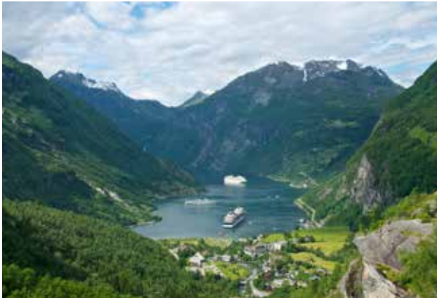
Flydalsjuvet - view point over Geiranger and Geirangerfjord