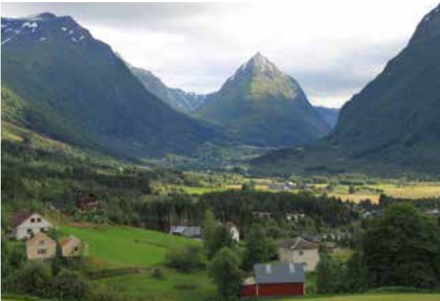
Byrkjelo and Mount Eggjenibba