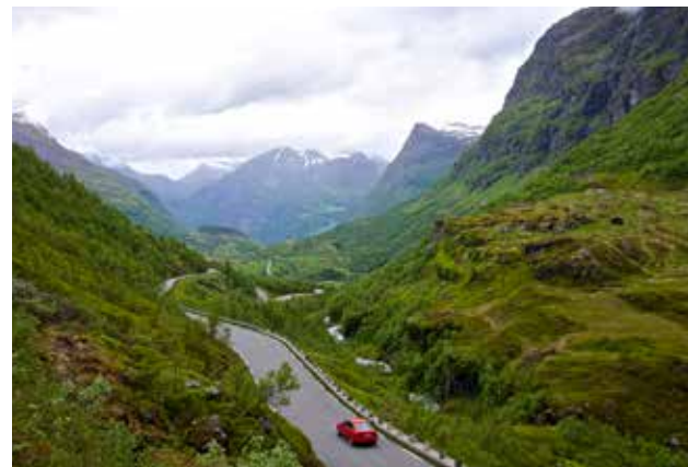
Scenic road from Dalsnibba to Geiranger